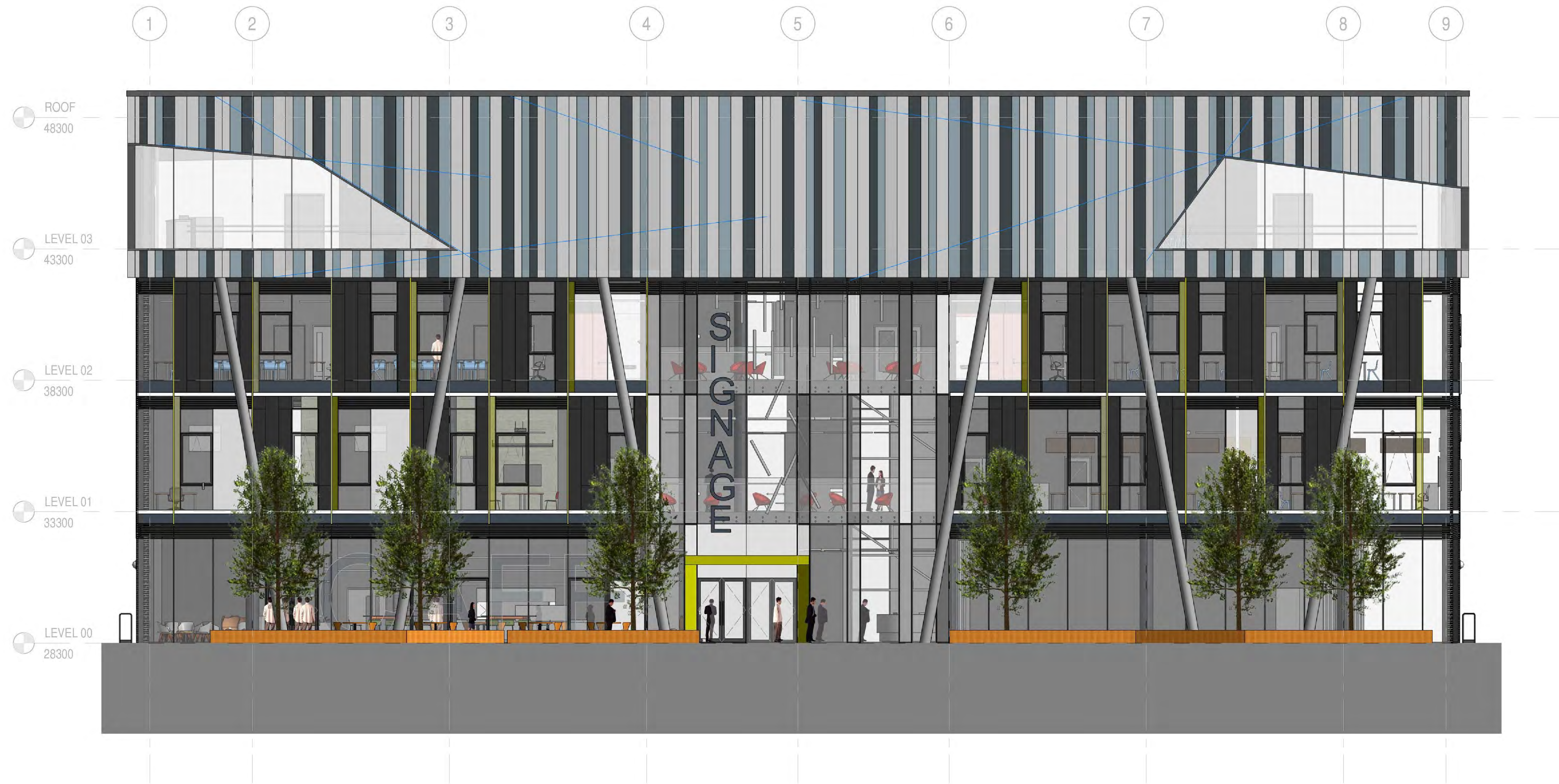
1 ELEVATION WEST 1 : 100